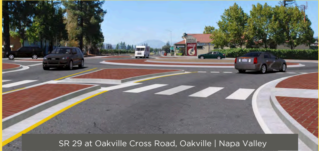
SR 29 at Oakville Cross Road, Oakville | Napa Valley