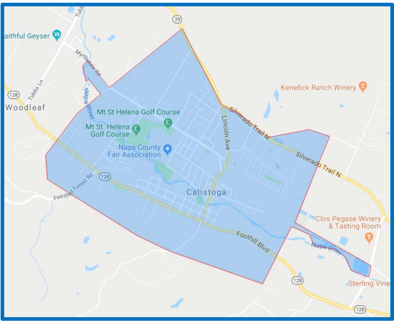
Figure 1: Census Tract 2020